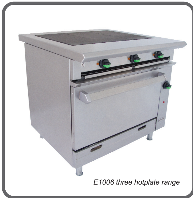
E1006 three hotplate range