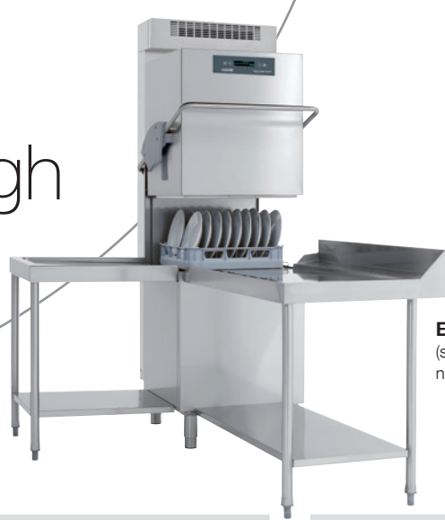
EVOLUTION 2135 WSHR (shown with tabling – not included)