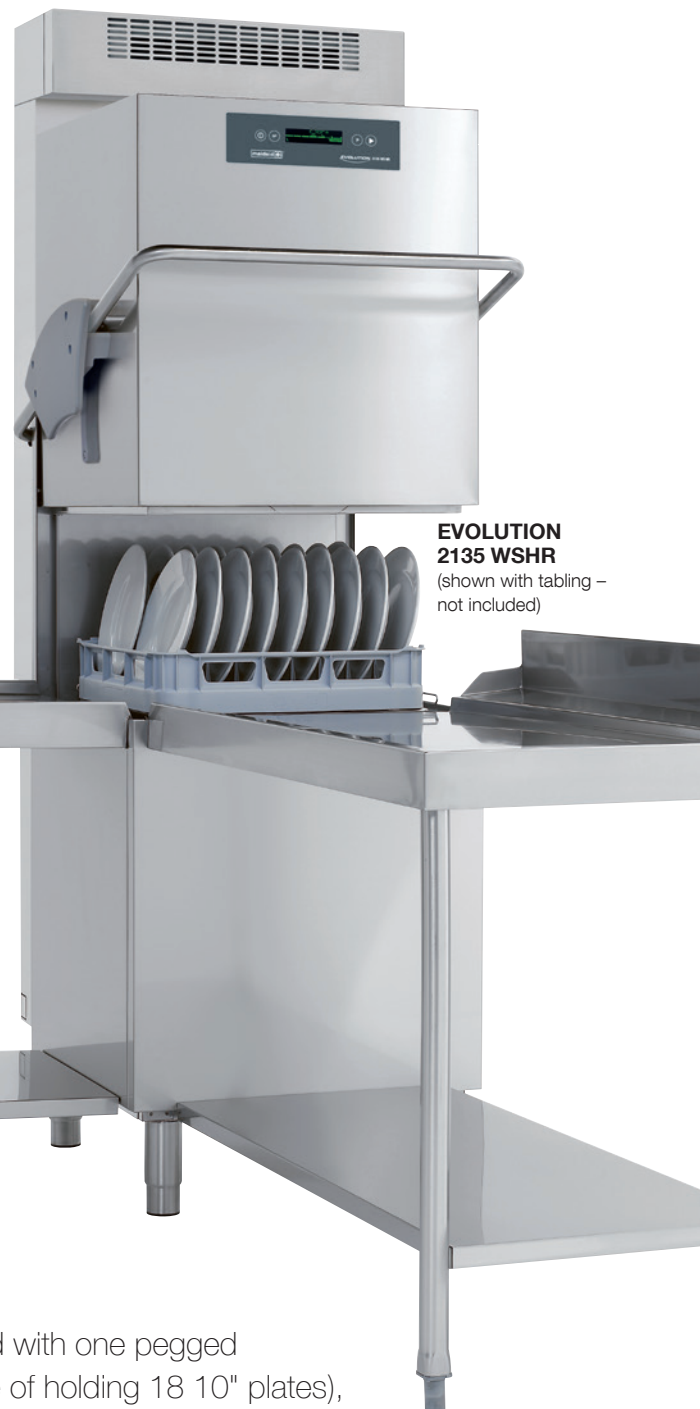
EVOLUTION 2135 WSHR (shown with tabling – not included)

Supplied with one pegged (capable of holding 18 10" plates), one open rack (capable of holding 25 pint glasses) and cutlery insert.